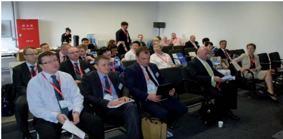
EWTC China Forum

Today EWTC consists of about 2 thousand business companies embracing 8 business associations, 17 non-associated transport and logistics companies, two regional administrations and two universities from twelve European and Asian countries (Belarus, Denmark, Kazakhstan, China, Lithuania, Mongolia, Belgium, France, Russia, Sweden, Ukraine and Germany). In 2010 the total Asia-Europe trade volumes reached EUR 552 billion. “We have an ambitious task ahead of us: to seek that within the mid-term perspective (10-15 years) 10 percent of this trade flow is served by members of our Association”, said President of EWTC.