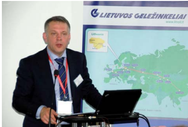
Eligijus Masiulis, Minister of Transport and Communication, Lithuania

The EWTCA China Forum was attended nearly by 50 participants from Belarus, China, Latvia, Mongolia, Kazakhstan, Sweden and Lithuania. Presentations were delivered by representatives of transport and logistics companies serving Asian-European trade flows, and by other outstanding experts. Representatives of the Ministries of Communication and Transport of Lithuania and China were also among the participants of the conference.