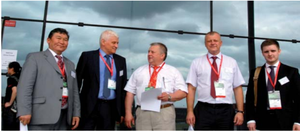
EWTC Association president A.Sakalys with Mongolian Vector partners

Strengthening co-operation between origin, transit and consumer countries along East West Transport Corridor; The East West Transport corridor in Southern part of Baltic Sea Region –a way for co-operation between Asia and Europe ; The development of “green corridors” using advanced technology and co-modality in order to achieve higher levels of energy efficiency and reduce environment consequences; Promoting good governance and exchange of best practices related to the reduction of barriers and simplification of border –crossing ; From China to the European market, the Lithuanian-Baltic gateway; New developments in Klaipeda Seaport –one of main transport hub in the Baltic Sea Region ; New Lithuanian railways and forwarding companies initiatives in development Europe – Asia connections (container train Merkurijus, Saule and other);