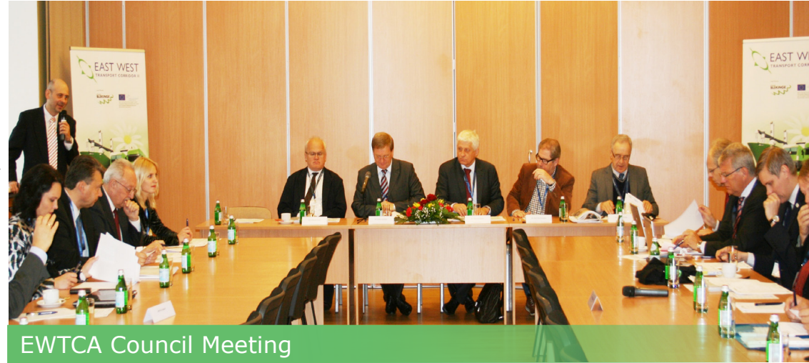
EWTCA Council Meeting